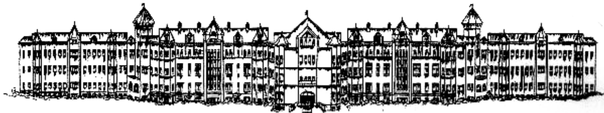
Illustration of Patton State Hospital Circa 1902 Based on a Lithograph by Vern Fowler

Patton State Hospital has provided mental health treatment since 1893 and has been accredited as a forensic mental health facility by the Joint Commission on Accreditation of Healthcare Organizations (JCAHO) since 1987. It is the largest maximum-security forensic hospital in the